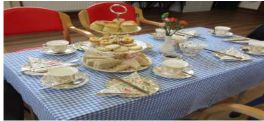
The prepared Table awaits the Guests