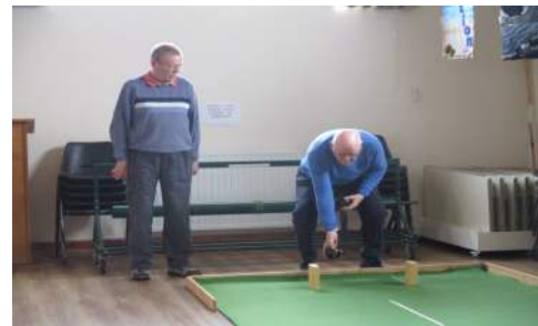
Then its on with the bowls