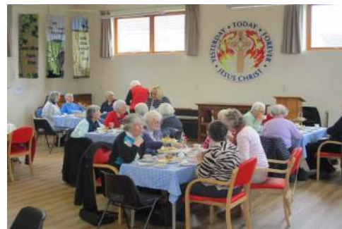
Some of those invited who enjoyed their afternoon

PANBRIDE MUSICAL MEMORIES SEE ARTICLE ON PAGE 5 Unfortunately no photographs but this new group is proving popular. See article on Page 5