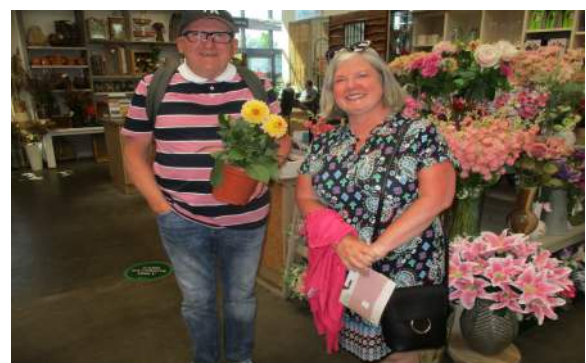
GEORGE, PINK FLOWERS MIGHT HAVE BEEN BETTER