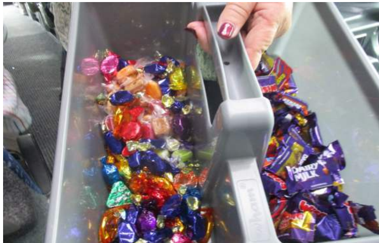
WE ARE ON OUR WAY - SWEETIE TIME

CONGREGATIONAL OUTING 2023 GOOD COMPANY, SUNNY, WARM DAY ENJOYABLE LUNCH, RETAIL THERAPY WELL ORGANISED, SUCCESSFUL DAY