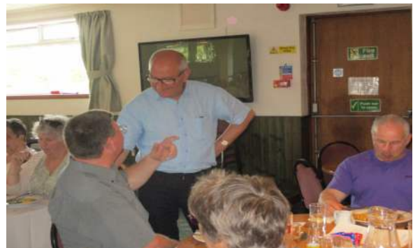
WHAT DID I TELL YOU?