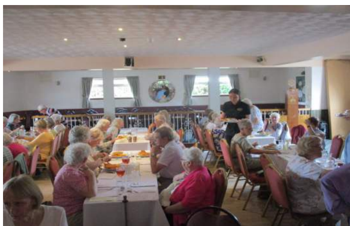
TIME FOR LUNCH STATION HOTEL STONEHAVEN

CONGREGATIONAL OUTING 2023 GOOD COMPANY, SUNNY, WARM DAY ENJOYABLE LUNCH, RETAIL THERAPY WELL ORGANISED, SUCCESSFUL DAY