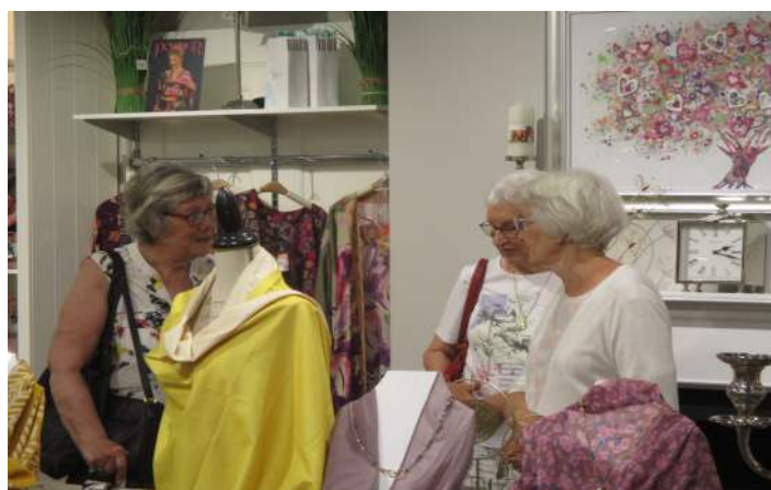
TEMPTED OR NOT TEMPTED?