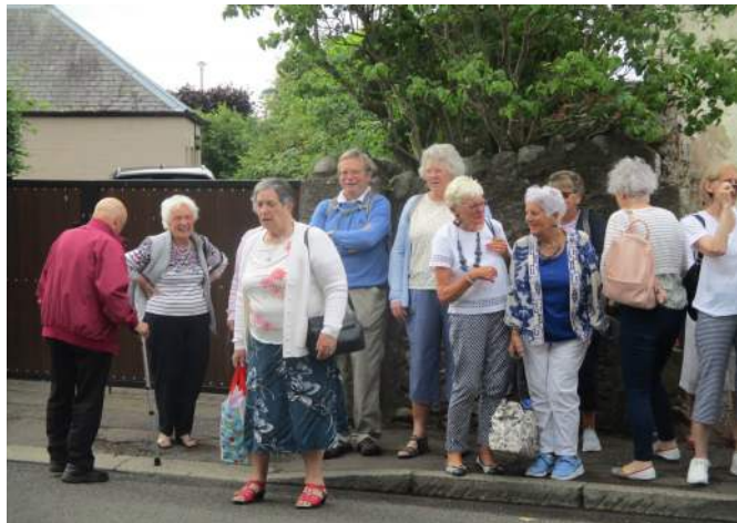
ANXIOUS ORGANISER, WAITING FOR THE BUS