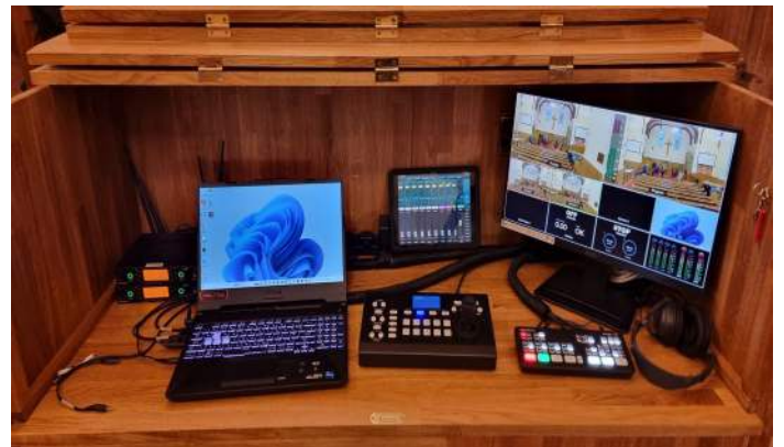
The Mixing Desk- (Mission Control)