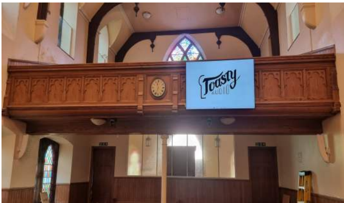
A screen for use of those in the chancel